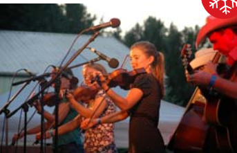
Columbia Gorge Bluegrass Festival July 22-25

Don't forget to grab a copy of the Winter 2010 Recreation Guide, available today! Be sure to check out these exciting upcoming programs: