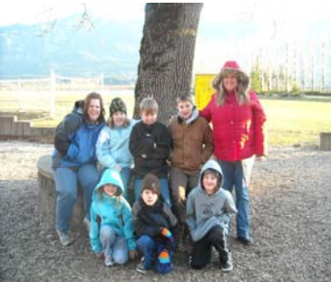
CASP participants will present the kids' cool creation table at Winterfest 2010.