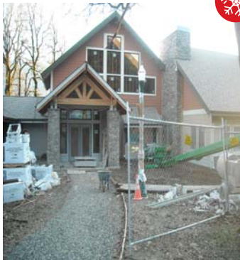
The Rock Creek Community Services Building should be complete by April 2010