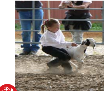
Skamania County Fair and Timber Carnival August 11-15

Stevenson branch of River-view Community Bank, and Tennon Accounting.